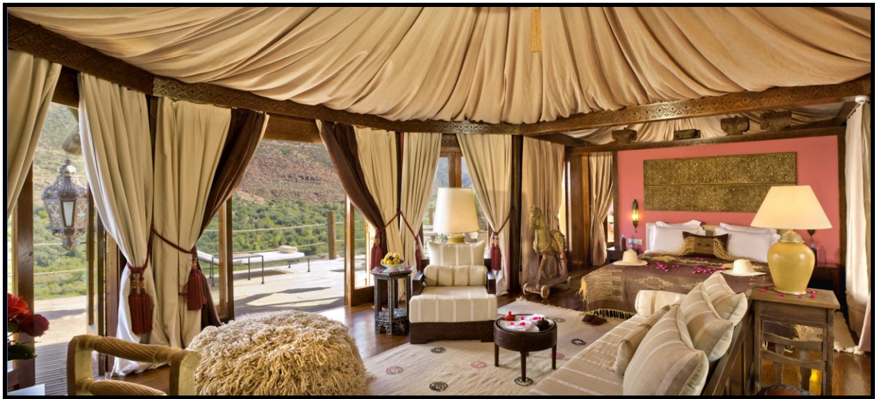
Kasbah Tamadot - Morocco

Engineered To Bring You Closer To Nature And Allow You The Romance Of Living Under Canvas, To Find The True Tranquility And Absolute Pure Passion Of Life!