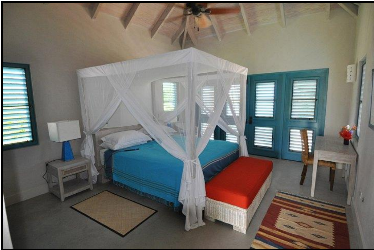
Evening Breeze Original