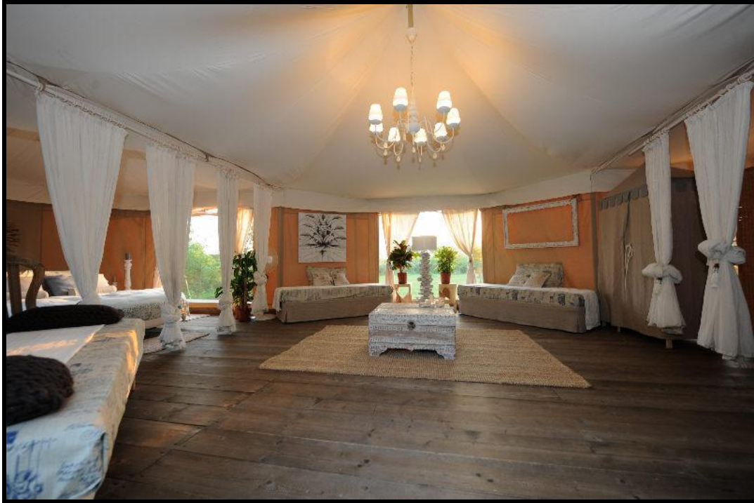
Kambaku at Canonici di San Marco

We are also proud to relate that the Italian Lodge, Canonici di San Marco , has recently added a Kambaku Tent that has received quite a lot of publicity in their local media. The owner, an accomplished attorney in her own right, has offered to assist any new tent owners in the region with their interior design – please contact her via her website if there is any interest from anyone out there.