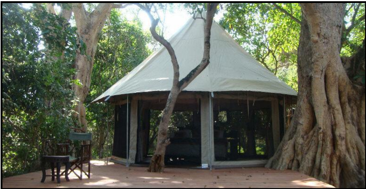
Bateleur Tent showing steel legs supporting the roof frame