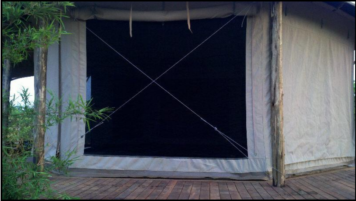
Cross-bracing for wind with steel cables - also illustrating wood poles supporting the tent frame

Though the wood pole uprights give plenty extra rigidity to the frame as mentioned above, we always recommend erring on the side of caution that one does some amount of vertical cross bracing for wind.