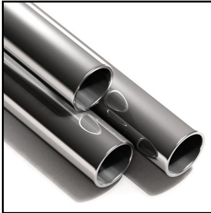
444 Stainless Steel Tubes

In discussing steel and frames, it is prudent that we also discuss the various steel types that we use for the tent frames. The most commonly used steel frame and least expensive is the mild "hot-dipped" galvanized ( passivated ) steel frames (available in olive green, gold or silver). This option is corrosion resistant but not advised for tents that will be set up in close proximity to the ocean as this option will rust in time.