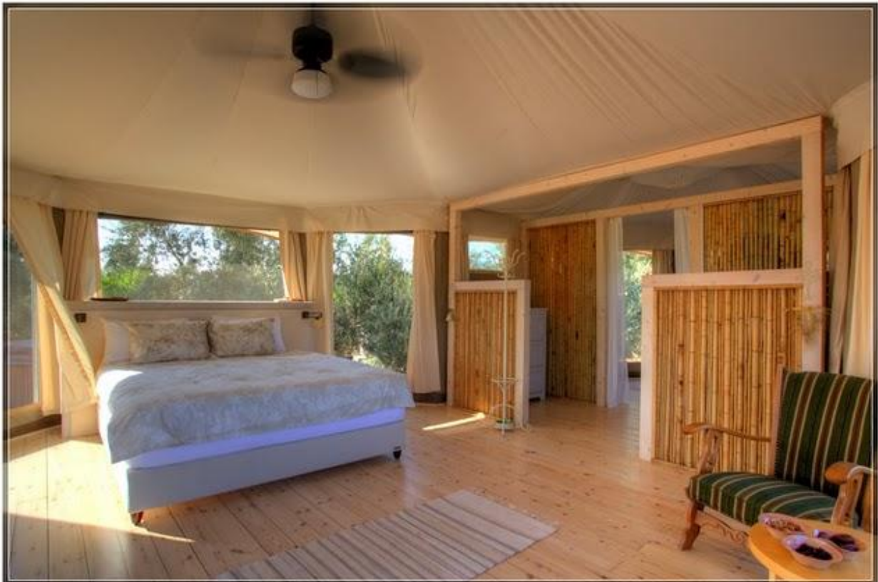
Bububu Tent – Hilla Farm