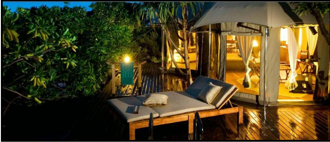
Banyan Tree Madivaru, Maldives

To be removed from this newsletter mailing list, please send an email from the email address you wish to have removed to remove@exclusivetents.com with "REMOVE" in the subject line.