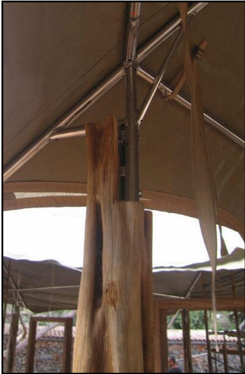
Decorative wood pole showing frame attachment

The most commonly used wood poles we supply are from the Australian Blue Gum Tree (Saligna) or Latin name Eucalyptus grandis but almost any strong wood pole will work. Indigenous decorative wood poles can also be used and sometimes look very good (as can be seen in the picture below)